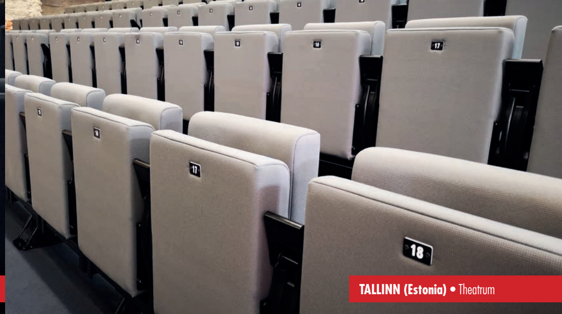
TALLINN (Estonia) • Theatrum