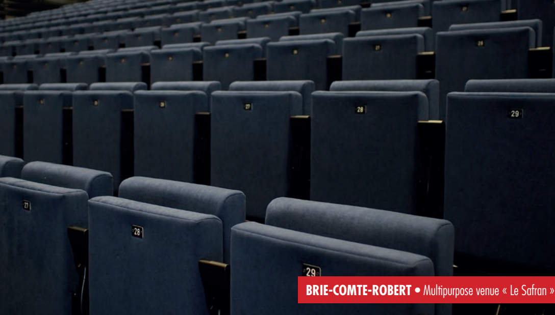
BRIE-COMTE-ROBERT • Multipurpose venue « Le Safran »