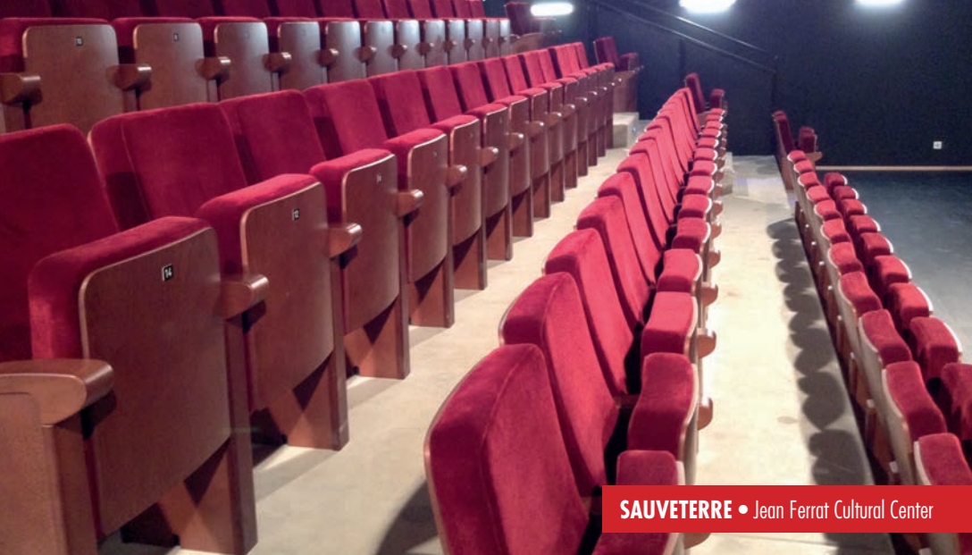
SAUVETERRE • Jean Ferrat Cultural Center