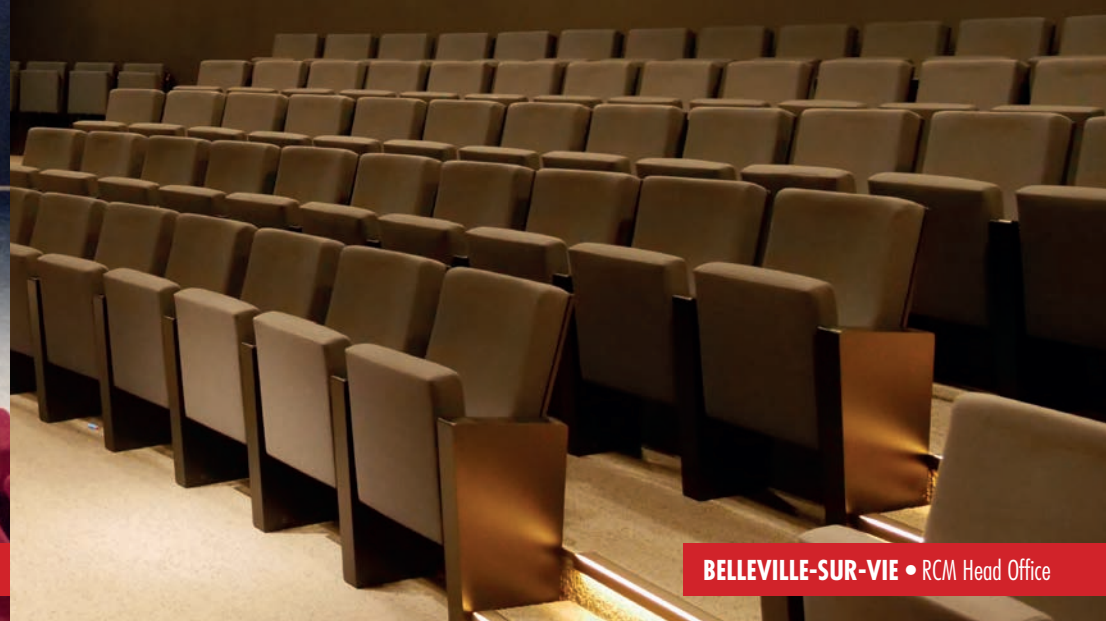
BELLEVILLE-SUR-VIE • RCM Head Office