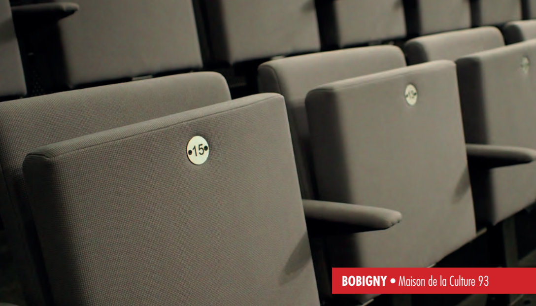
BOBIGNY • Maison de la Culture 93