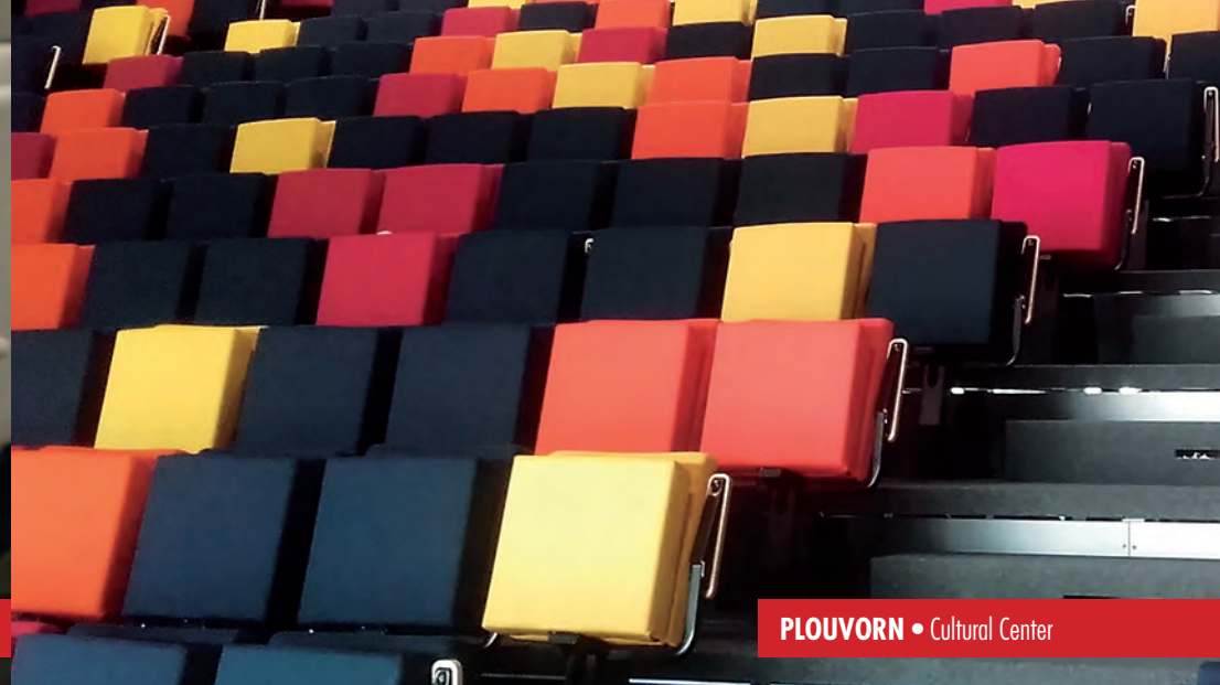
POUVORN • Cultural Center