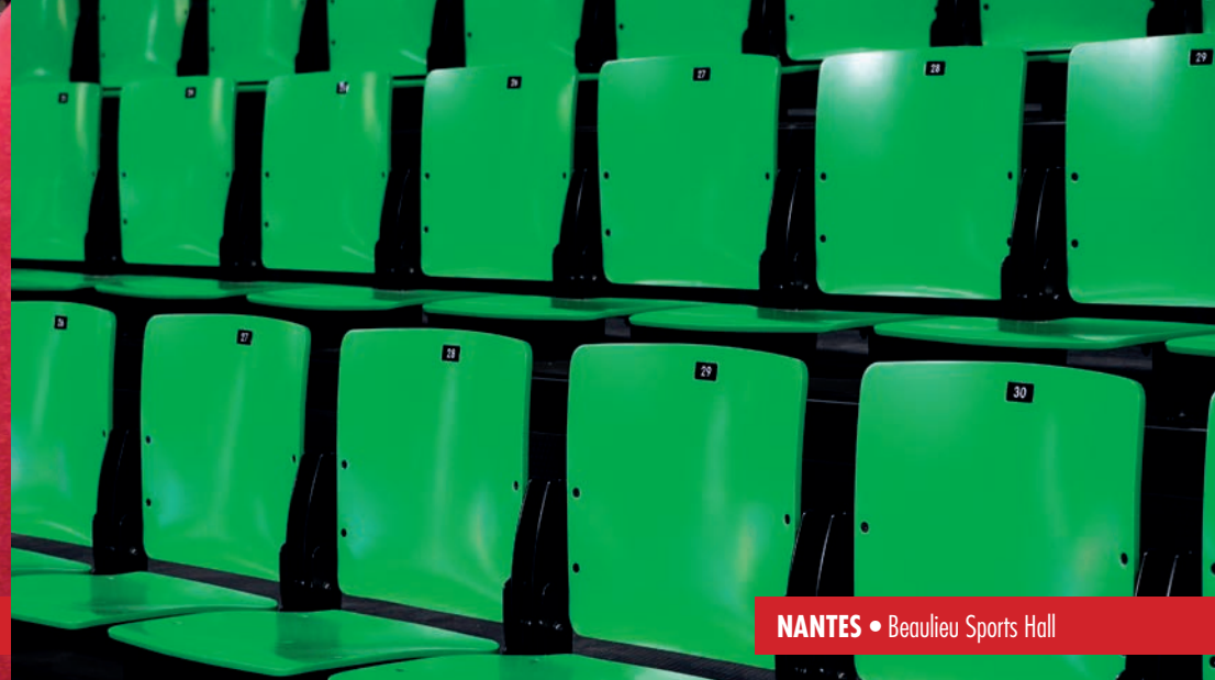
NANTES • Beaulieu Sports Hall