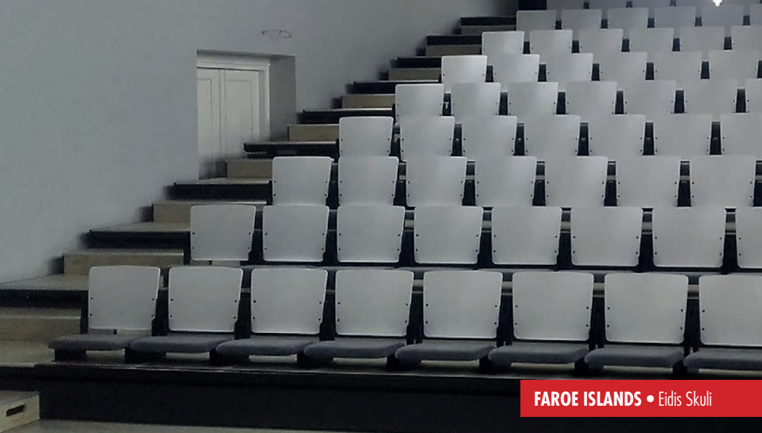
FAROE ISLANDS • Eidis Skuli