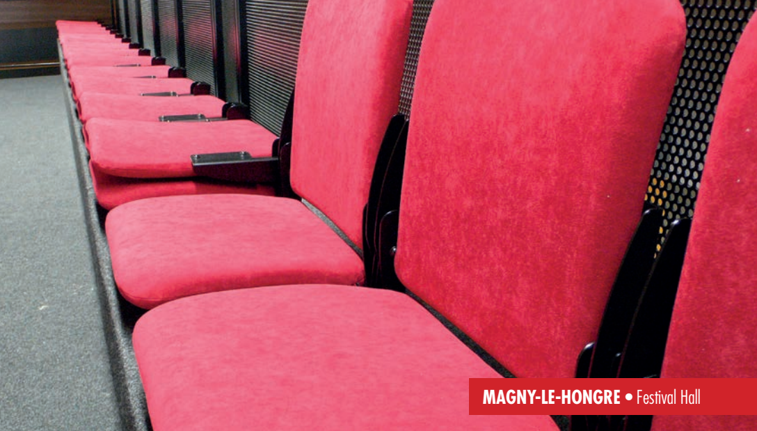
MAGNY-LE-HONGRE • Festival Hall